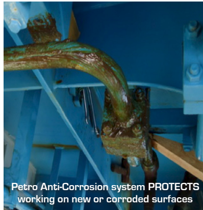
Petro Anti-Corrosion system PROTECTS working on new or corroded surfaces