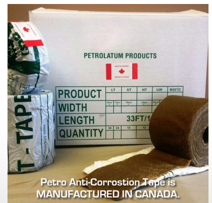
Petro Anti-Corrosion Tape is MANUFACTURED IN CANADA.