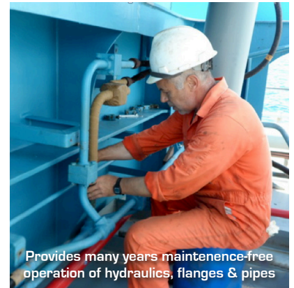
Provides many years maintenance-free operation of hydraulics, flanges & pipes